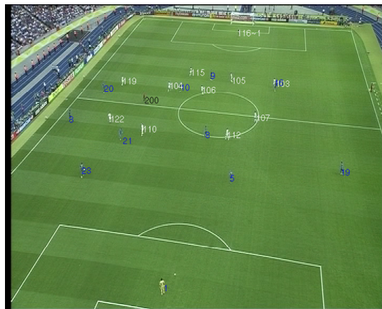
Figure 3: Tactical camera view of the World Cup final 2006.

In this article we have proposed a real-time multiple target tracking method based on Rao-Blackwellized Resampling particle filtering for tracking soccer player identities. We presented the necessary extensions of an so far only theoretically evaluated state-of-the-art multi-target tracking method to handle real